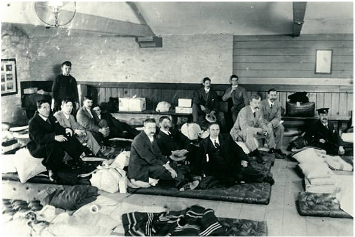
Above: Titanic survivors ashore at Millbay Docks, Plymouth, England, May 1912.

9 - the number of days spent in the search for survivors.